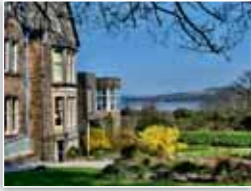
Cumbria Grand Hotel Grange over Sands