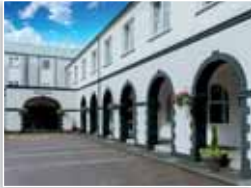
Ben Nevis Hotel & Leisure Club Fort William