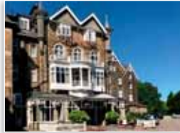
The Cairn Hotel Harrogate