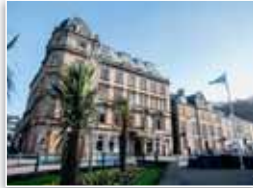
The Royal Hotel Oban