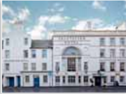
Salutation Hotel Perth