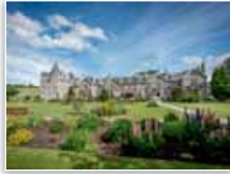
Nethybridge Hotel Inverness-shire